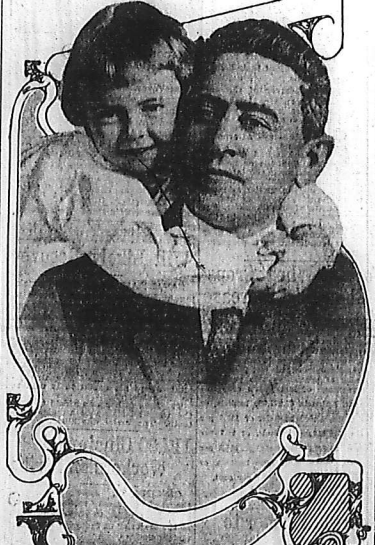
GOVERNOR NAMES EXPO COMMITTEE

GOVERNOR NAMES EXPO COMMITTEE There was much exposition talk in the Capitol Tuesday morning. Governor Brown announced the Georgia Commission for the Panama Exposition to be held in San Francisco in 1915, while a request was received from the Anglo-American Exposition to be held in London in 1914 that Georgia arrange for an exhibit there.