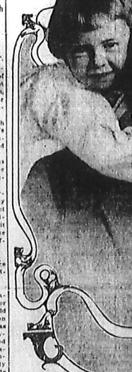
"You Are Going to Vote for My Daddy, Aren't You?" She Says, and It's Hard to Resist.